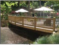
DECK / OVERLOOK