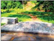
MARLBROOK ENTRY W/ RAMP