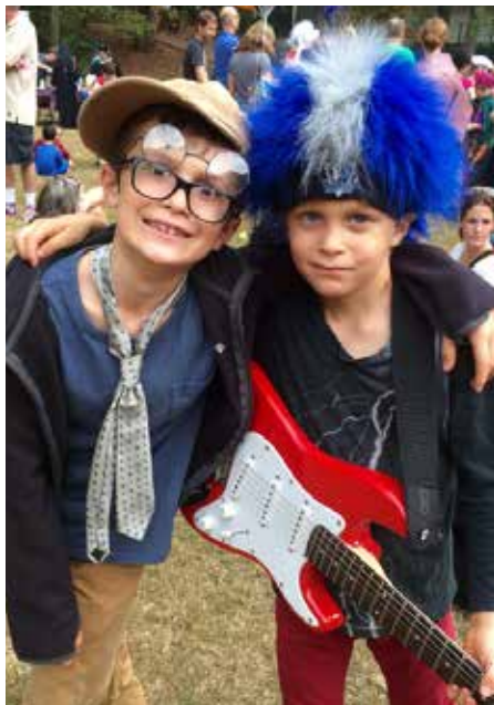
Creativity from Sutherland Place -- two of the many unique costumes

Our neighborhood is full of superheroes, princesses, monsters, Star Wars and Harry Potter characters, and tons of just plain cuteness. The proof is on Page 3. Lake Claire neighbors and friends dressed in their festive and frightful best and paraded into the park on October 24. The crowd was quite large and the