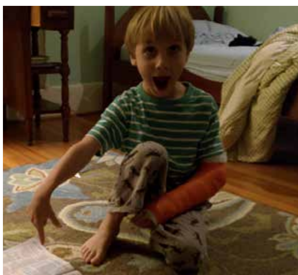
Woody (see web version to see orange cast)