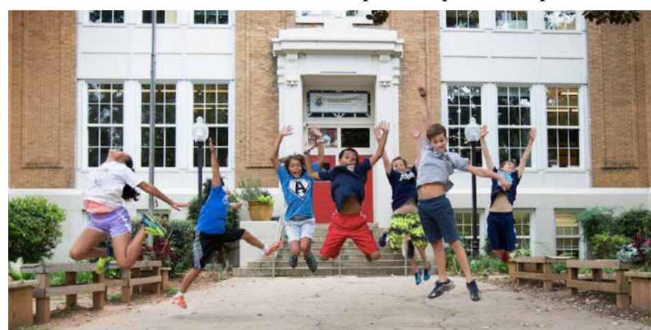
Kids in front of ANCS

nity, participate in a mindfulness activity, watch student performances, sing, and dance (yes, the middle schoolers at ANCS dance!). The students then travel with their classes or advisors to their classrooms. Teachers greet each student at the front door to the room to ensure the student has a positive experience entering the room. Students do their morning routines and then