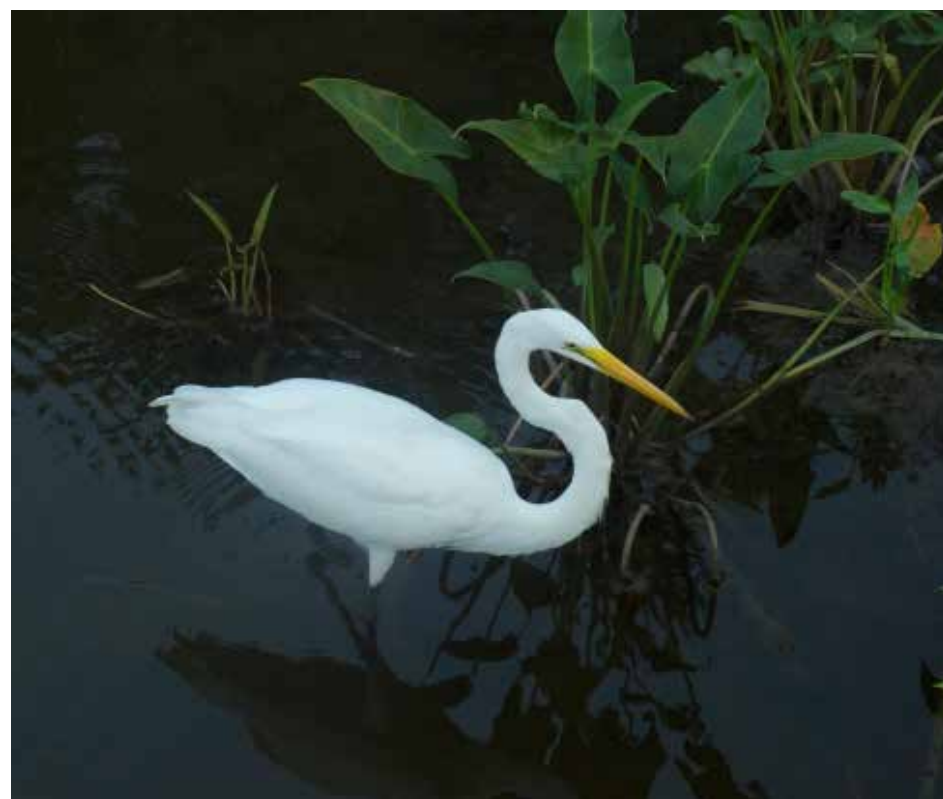
Great Egret spotted on CP Pond

Well, please be in touch if you want to count bugs with Meta and me, or if you spot any wild-life around the neighborhood. I'm cvanderschaaf@bellsouth.net —a.k.a. Carol V