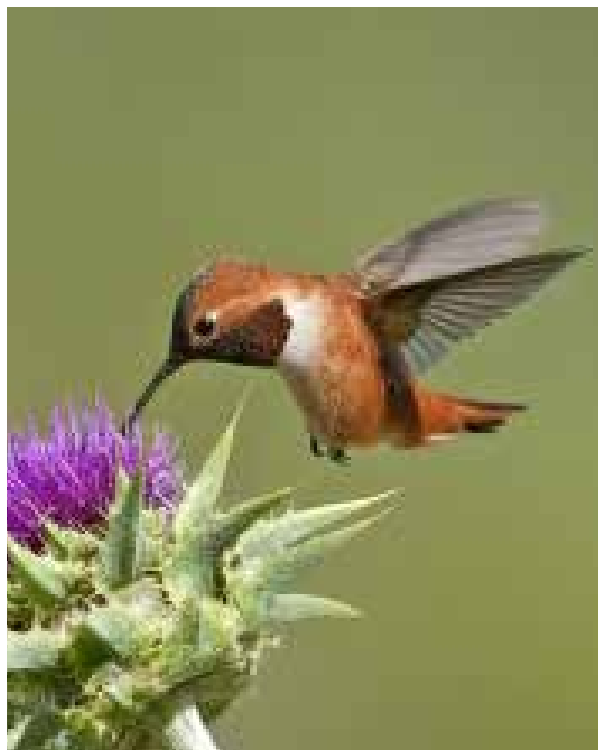
Hummingbird

All the annuals I listed above can be grown from seed without much trouble because that is how I get the flowers I want in the colors I plan. If you are a beginner or working with children, then I recommend starting with marigolds and zinnias because they germinate and bloom quickly. This year I planted the giant Benary zinnia seeds directly into the ground. Because we had plentiful rainfall most of the spring, I not only got huge plants, but also quite a bit of self-seeding. However,