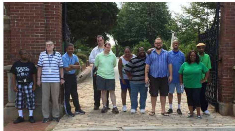
Adults at Oakland Cemetery.