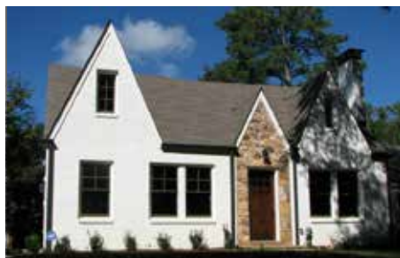
Lakeshore Home on the Tour

Almost 25 years ago a group of our neighbors collaborated to share the spirit of Lake Claire and spotlight its many hidden treasures. This collaboration turned into the first Lake Claire Tour of Homes. It was officially named the Lake Claire Tour of Funky Homes and Gardens . The tour showcased homes with 'funky' features such as mouse-