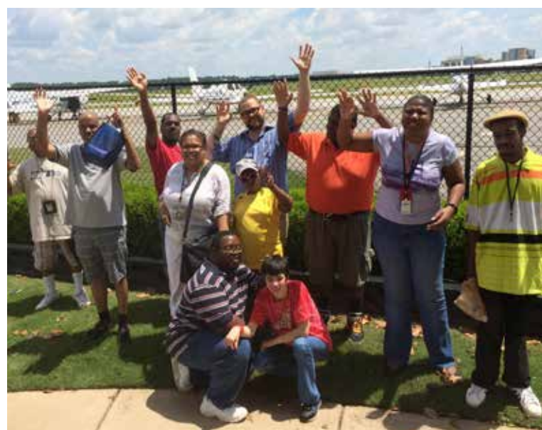
The Frazer Center's Adult Program spends as much time as possible out in the greater community -- this group is touring the DeKalb-Peachtree Airport.

tions can be and should be experienced by all types of individuals. Diversity is good, and the adults at the Frazer Center are such enjoyable people, so having them out in the community as much as possible is beneficial for everyone!