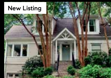
Lake Claire 506 Harold Avenue

404.932.3003 | 404.668.6621 leeanddarlene@compass.com