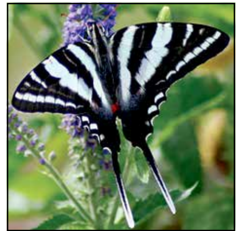
Two striped butterflies present in our region: the longwing zebra ( Heliconius charithonia , top) and the zebra swallowtail ( Protographium marcellus , bottom). Go to the online Clarion on the LC Website to see the butterfly pics in color.