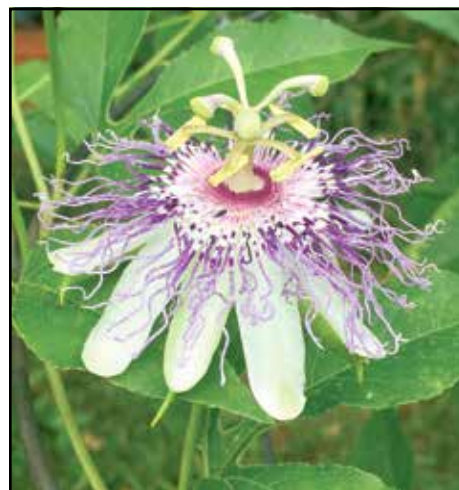
Maypop flower ( Passiflora incarnata )

Perrot / Antia Yard, a must-see in color, which you can on the LC website