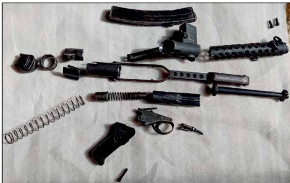
Unassembled MK-4 Pieces