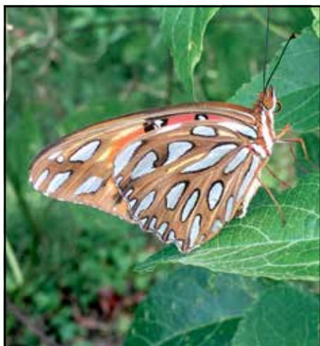
Gulf Fritillary ( Agraulis vanillae )

Perrot / Antia Yard, a must-see in color, which you can on the LC website