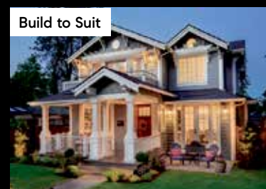
Candler Park 516 Candler Park Drive