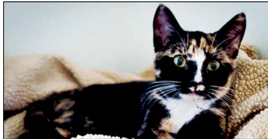
Samantha, a kitten currently in foster through PAWS Atlanta, who will soon be up-for-adoption at Java Cats Cat Café