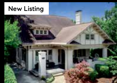
Poncey Highland 965 Ralph McGill Boulevard