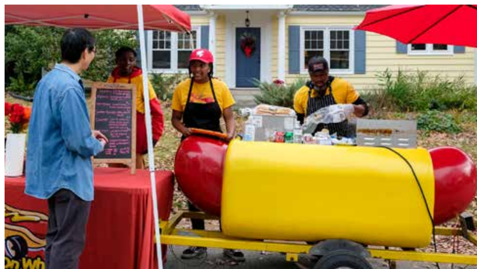
Dogs on Wheels, one of the food trucks in the fest, on Ridgewood again this year, serves meat and vegan dogs.

There are many moving parts to this, and we apologize for any errors, but luckily, this is our opportunity for a draft for you to preview: all will be fixed on the final listing/map that is handed out at every location. Contact editor@lakeclaire.org before November 17.